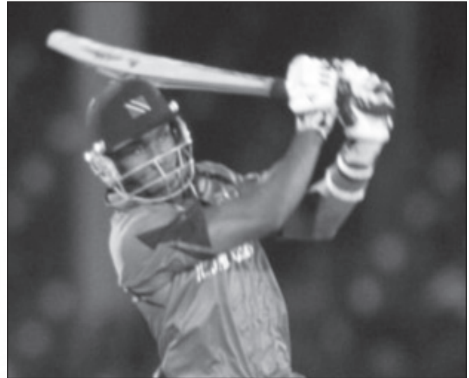
Dwayne Bravo: "Our bad game was against Guyana and they went on to win"

T&T, who took out their frustration at missing out on a lucrative Champions League spot through a ten-wicket thrashing of Jamaica in the third-place play-off, had reached the semi-finals after winning all three league matches. "Our preparation was spot on and until we lost in the semis we played good cricket," Bravo said. "We were consistent and we were winning our games by large margins. I can't point fingers at this moment but I thought we had a good tournament."