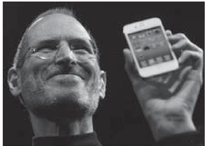
The new handset has two cameras and allows users to video-chat

Mr Jobs also ran through changes made to the fourth release of the iPhone operating system, now called iOS. Apple previewed many of these features