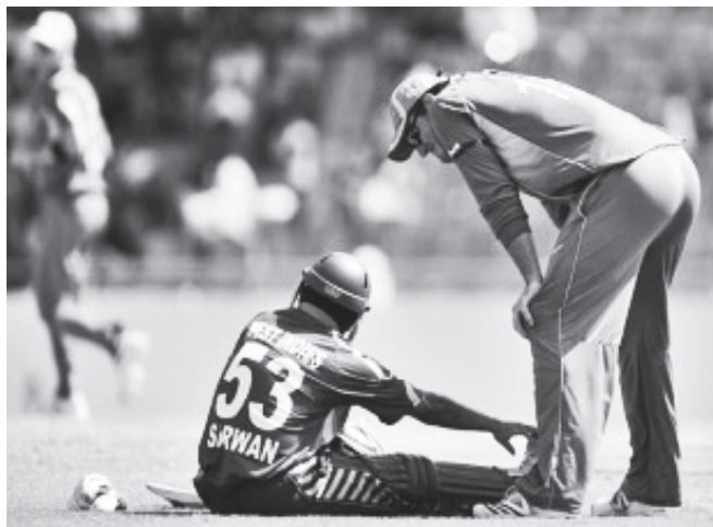
Injury prone: Ramnaresh Sarwan pulled a hamstring during an ODI against South Africa in May