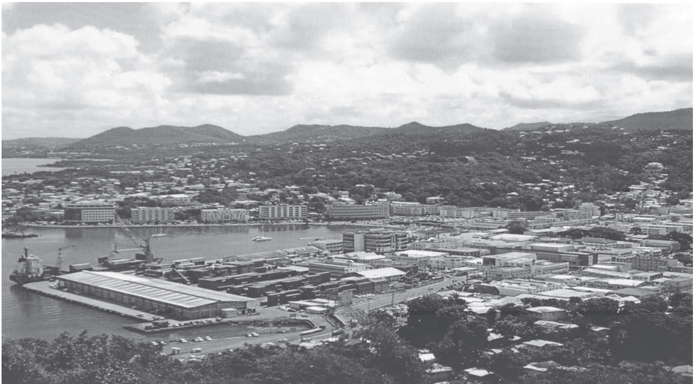
Now: View of Castries Harbour, Saint Lucia

Image from Sir Charles Watson's album of photographs taken between 1893-1896.