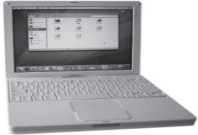
The 12-inch Apple iBook G4. Worth an update?

Or, as possibly a better option, imagine this: Take the iPad's basic internals, add a next-generation dual-core Apple A4 processor, tack on a built-in keyboard, and, presto, a very unique clamshell