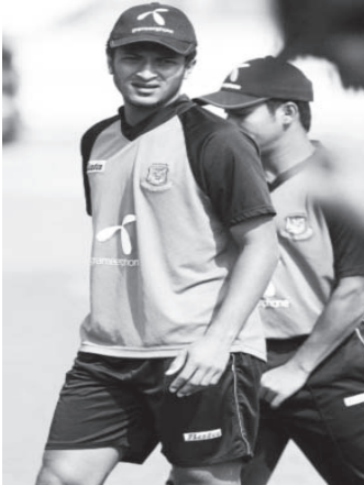
Shakib Al Hasan confirmed he was approached by someone wanting information

Bangladesh's captain, Shakib Al Hasan, has confirmed he received an approach from an unknown person whom he believed wanted him to manipulate the result of a one-day international against Ireland.