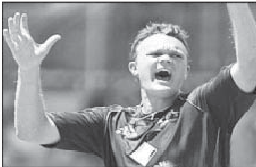
Bollinger took four wickets as Australia beat the Windies

Denesh Ramdin and Narsingh Deonarine's 46-run partnership and Kieron Pollard and Smith's 37-run stand added some respectability to