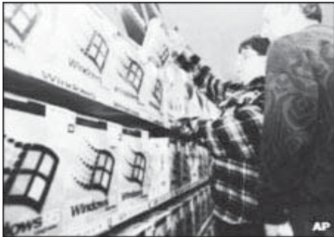
The bug dates from the days of Windows NT 3.1

A 17-year-old bug in Windows will be patched by Microsoft in its latest security update.