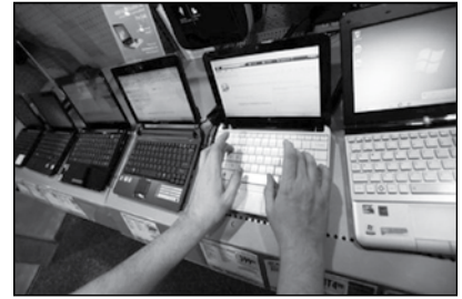
Netbooks are under pressure as tech firms concentrate on mobile computing

The netbook, and its limitations, will be well and truly left behind.