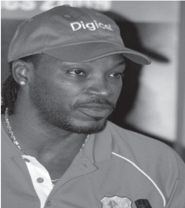
Chris Gayle could yet return in time for the Champions Trophy

West Indies could yet field a full-strength squad at the Champions Trophy, with the ICC willing to accept a "revised" line-up in the event the industrial relations dispute between the board and the players is resolved. Despite setting an August 11 deadline for national boards to nominate their 15-man squads for the Champions Trophy, the ICC has advised the WICB it would take into account the exceptional circumstances brought on by the labour dispute and allow the likes of Chris Gayle, Denesh Ramdin and Shivnarine Chanderpaul to play at the tournament.