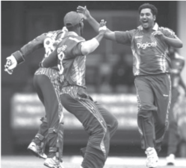
Players contracted the IPL will be mitigated against any loss of earnings

In a significant change from the recent disputes over payments, the West Indies Cricket Board (WICB) has announced a pay hike of significant proportions to the national players. The board did not reveal any figures but the Trinidad and Tobago Express has reported that the 20 players bound for the England tour next month will receive US$1.5 million between them as against the usual figure of $250,000-$300,000.