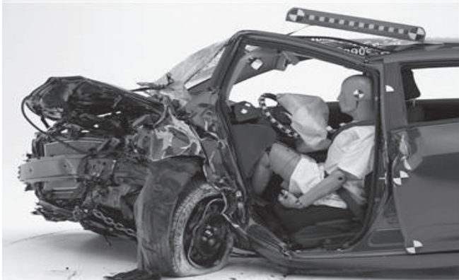
This handout photo provided by the Insurance Institute for Highway Safety shows a 2009 Toyota Yaris after the Institute's 40-mph frontal offset crash.

Fuel-efficient, affordable mini cars may not be as safe as larger vehicles