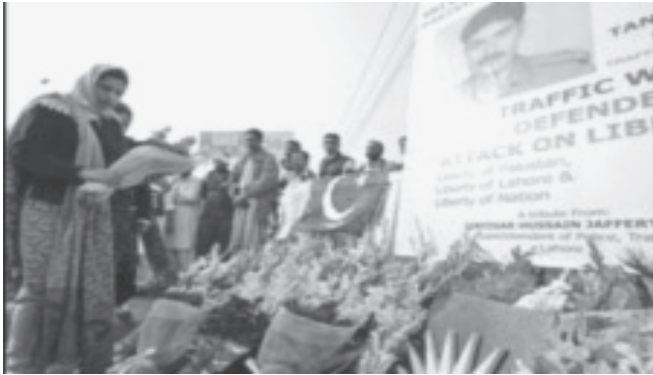
Tributes are laid at the scene of the shootings in Lahore

Chris Broad has angrily criticised security in Pakistan after being caught up in Tuesday's Lahore terror attack.