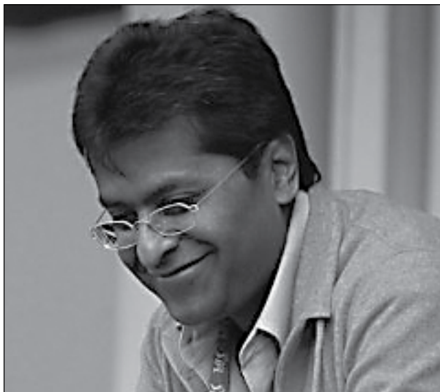
Lalit Modi says the Champions League will encourage stars to play more domestic cricket

Lalit Modi, chairman of the Champions League Twenty20's governing council, is certain the tournament will result in the "rapid growth" of club cricket around the world. Modi also said there was a strong chance the Champions League would be taken to non-cricket playing countries as a means to expand the game's reach and get other countries to embrace cricket.