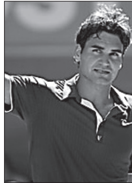
Federer had an easy passage into the third round