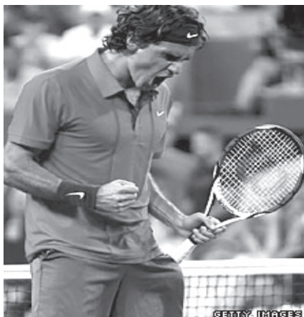
Federer last lost at the US Open against David Nalbandian in 2003

One Slam away from Sampras' record, he plans to play for a long time