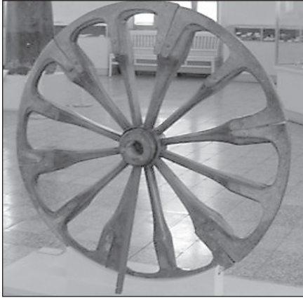
The wheel was invented in circa 4000 BCE

Continuing improvements led to the furnace and bellows and provided the ability to smelt and forge native metals (naturally occurring in relatively pure form).[21] Gold, copper, silver, and lead, were such early metals. The advantages of copper tools over stone, bone, and wooden tools were quickly apparent to early humans, and native copper was probably used from near the beginning of Neolithic times (about 8000 BCE). Native copper does not naturally occur in large