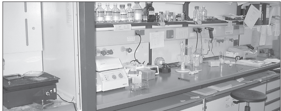
Part of a scientific laboratory at the University of Cologne

Technology is often a consequence of science and engineering — although technology as a human activity precedes the two fields. For example, science might study the flow of electrons in electrical conductors, by using already-existing tools and knowledge. This new-found knowledge may then be used by engineers to create new tools and machines, such as semiconductors, computers, and other forms of advanced technology. In this sense, scientists and engineers may both be considered technologists; the three fields are often considered as one for the purposes of research and reference