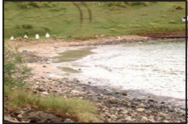
A beach area in Saint Lucia

“The theme for World Environment Day is “Oceans and seas – Wanted Dead or Alive? This theme has special significance for St. Lucia since many of our economic activities whether they be tourism, fishing or maritime transportation depend directly on the state of our coastal and marine environment.”