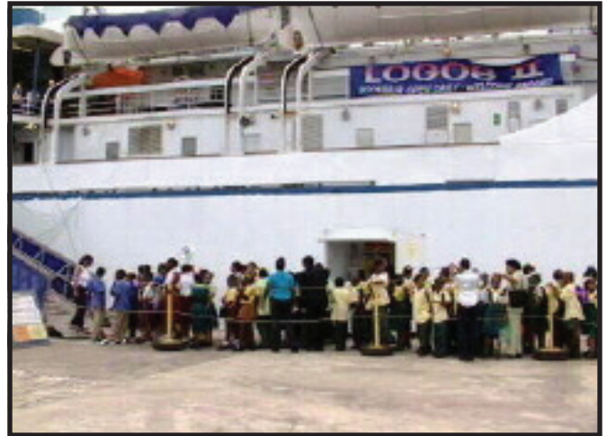
Logos II berthed at Pointe Seraphine

The Logos II will be berthed at Pointe Seraphine from June 30th to July 19th, 2004.